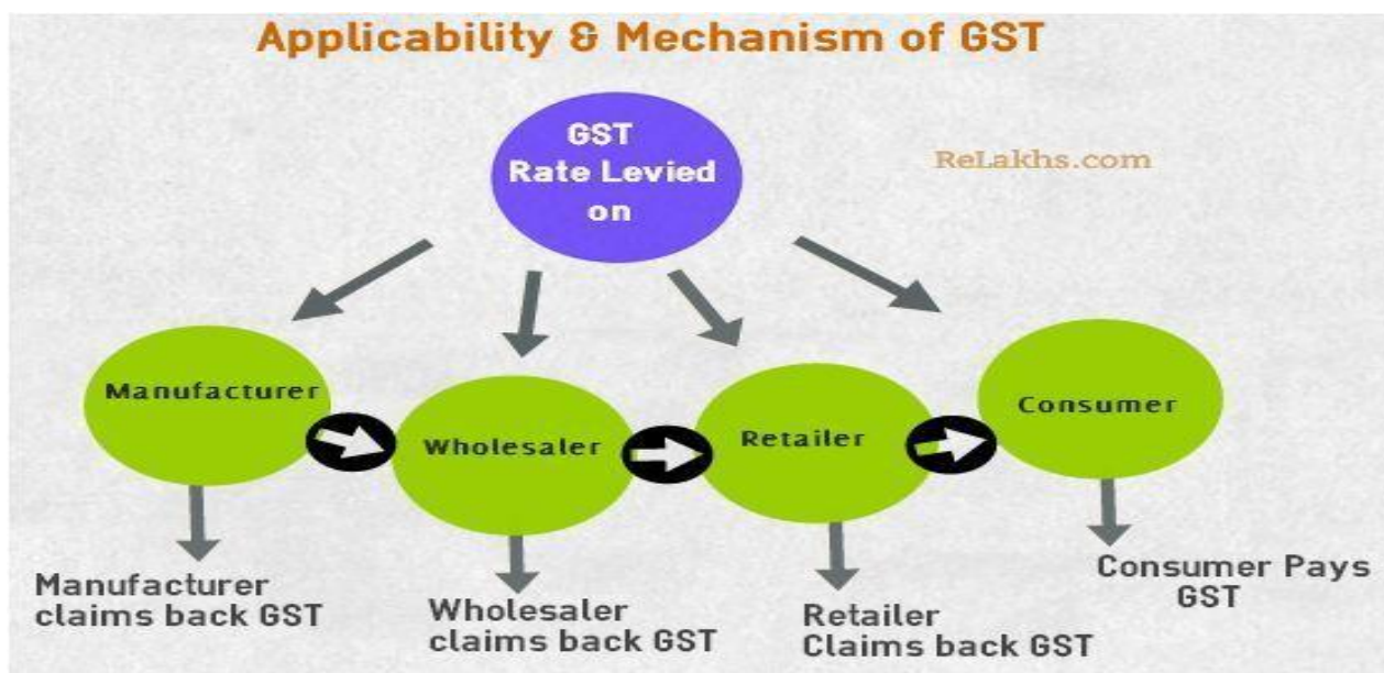
Figure 1. Mechanism of GST

But being the last person in the supply chain, the end consumer has to bear this tax and so, in many respects, GST is like a last-point retail tax. GST is going to be collected at point of Sale.